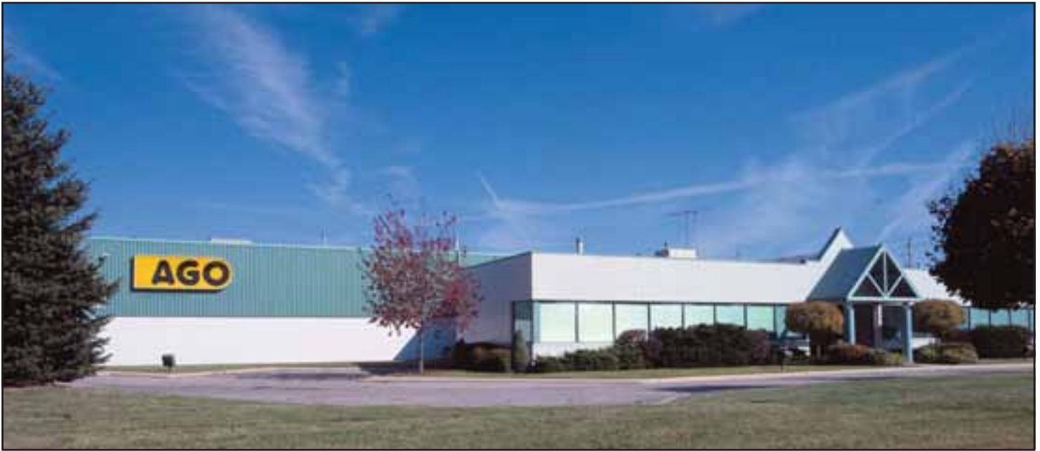
AGO's manufacturing facility located in London, Ontario

Ph: (519) 452-3780 Fx: (519) 452-3053 Em: mail@ago1.com Ws: www.ago1.com